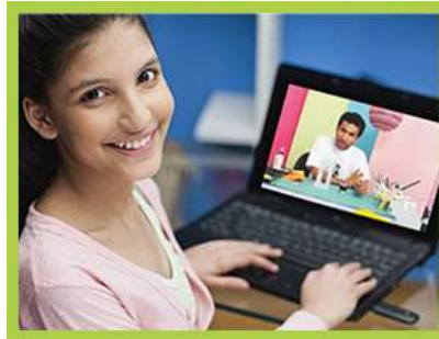
Live Online Lectures Also Available