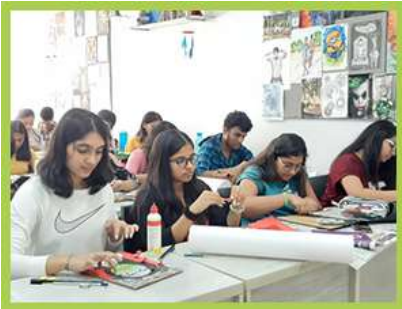
Classroom Lectures @ All SILICA Centers