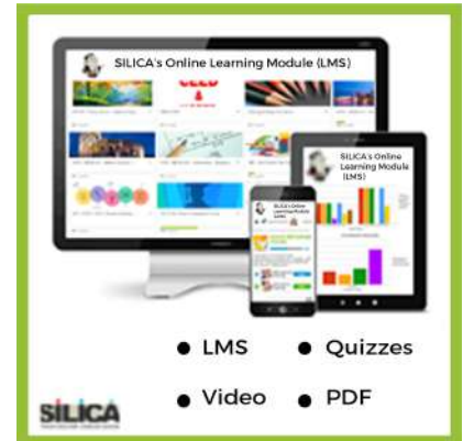
Online Learning App Throughout Course