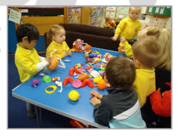
Reference Image: <a href="http://www.communityschool.com/RelId/623501/ISvars/default/Tour_Ecc.htm">http://www.communityschool.com/RelId/623501/ISvars/default/Tour_Ecc.htm</a> Reference Image: <a href="https://www.stellamarisschool.co.uk/photo/nursery-classroom/132633">https://www.stellamarisschool.co.uk/photo/nursery-classroom/132633</a> Reference Image: <a href="https://pendreplaygroup.wordpress.com/classroom-and-outdoor-areas/">https://pendreplaygroup.wordpress.com/classroom-and-outdoor-areas/</a>